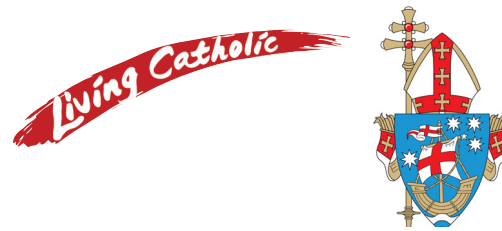
Archdiocese of Adelaide

45 Wakefield Street, Adelaide SA 5000 T 8215 6700 E enquiries@centacare.org.au www.centacare.org.au careers | volunteering | donate